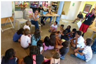
Oral Health Education at NAC housing summer camp for youth.

Native American Connections has been selected by the DentaQuest Foundation to be part of the nationwide Oral Health for all 2020 campaign.